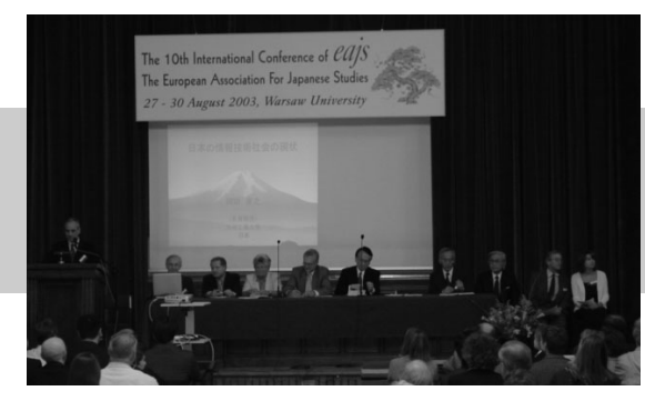
General Meeting of the 10<sup>th</sup> European Association of Japanese Studies in Warsaw in August 2003

The Foundation appoints base institutes to play a core role overseas in