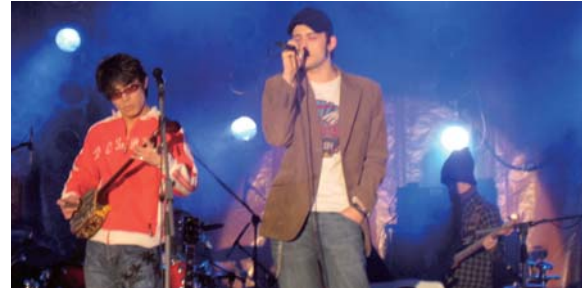
Performing live in Europe

In the field of performing arts, the Japan Foundation arranged overseas tours for a total of 35 groups encompassing every genre from traditional Japanese music and theater to drama, jazz, and pop. Particularly acclaimed was a four-nation European tour by the rock band MIYAZAWA, led by singer Kazufumi Miyazawa.