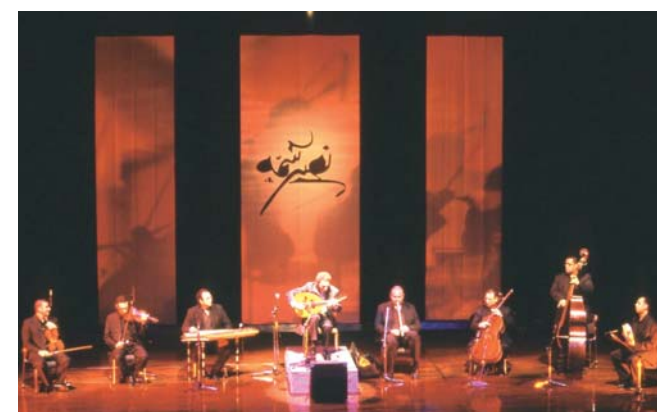
Naseer Shamma in performance