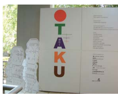
Japanese Pavilion entrance