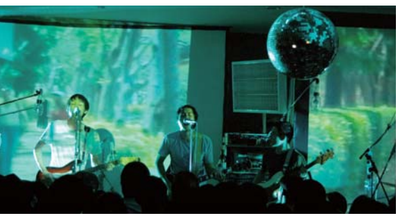
Concert in Bangkok

From September 10 to 15, the SOI Music Festival was held to showcase Japanese and Thai "indie" music. The event, which took place in Bangkok, was cosponsored by the Japan Foundation there and local supporters. In October, the event was repeated in Tokyo with assistance from Japan Foundation headquarters.