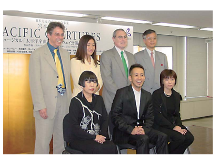
Announcing the production at Japan Foundation headquarters (July 2004)

The show created quite a sensation, attracting an audience of 70,000 spectators during its December 2 to January 31 run.