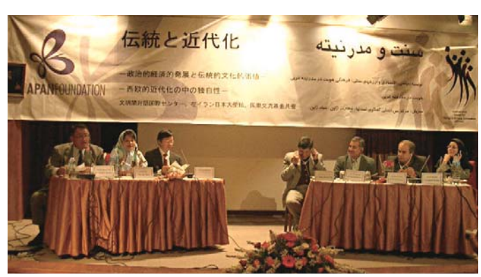
Symposium in Iran

In March Japanese and Arab scholars engaged in policy research as well as journalists gathered for a meeting in Cairo to set a priority agenda for intellectual exchange between Japan and Arab nations. On the day of the meeting, researchers from universities and think-tanks in Japan and Arab countries gathered together to engage in lively discussions of three subjects: globalization and international order, development and international cooperation, and security issues.