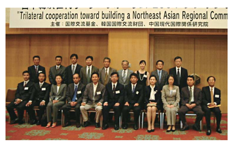
Forum in Fukuoka

The opening of the 2004 forum, which took place in Korea, was attended by some of the participants from the previous gathering, which further strengthened ties among these future leaders. If participants in these two forums held to date can maintain the network they have established, and put it to beneficial use in their respective fields, they may be able to make a substantial personal contribution to stability and development in the Northeast Asian area.