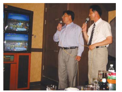
Socializing together in Seoul