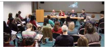
Talk on contemporary Japanese performing arts (February 2005)

To ensure continued enhancement of Japanese studies, the Japan Foundation, London began taking steps to rebuild its network of past fellowship participants. In accord with the British government's decision to strengthen language instruction at the elementary