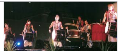
Performance of Japanese drumming by the Osaka Dadada-Dan Tenko

The Japan Foundation, Cairo offered a wide range of Japanese cultural events, including a performance of Japanese drumming, a week of Japanese movies, and a demonstration of Okinawan dancing. In addition, an eagerly anticipated Japan-Arab Policy Researchers'