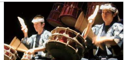
Ondekoza drummers in performance

The Japan Foundation, Budapest organized or supported several events in Hungarian cities other than Budapest, including a festival of contemporary Japanese films in Szeged and an exhibition of Japanese dolls in Keszthely. January 2005 marked the