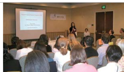
First National Symposium on Japanese Language Education

When the decision was made in 2004 to add Japanese to the list of subjects in the prestigious Advanced Placement (AP) program in the U.S., the Japan Foundation, Los Angeles immediately took action. It agreed to subsidize half the associated development costs, and assisted in designing the AP curriculum and compiling examination questions. The Foundation also organized the First National Symposium on Japanese-Language Education in the U.S., inviting