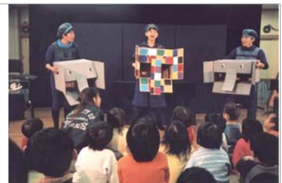
Kazenoko theatrical company on tour

In the aftermath of terrorist incidents, the Japan Foundation, Jakarta responded to concerns about large gatherings and regretfully canceled its high school Japanese speech contest. However, it successfully presented a concert by the Japanese a capella group INSPi; and it arranged a highly successful tour by the Kazenoko theatrical company,