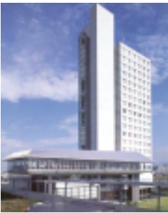
▲ The Japan Foundation Japanese-Language Institute, Kansai