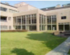
▲ The Japan Foundation Japanese-Language Institute, Urawa

The Japan Foundation Japanese-Language Institute, Urawa, was established in 1989 in response to the rapidly rising number of students learning Japanese, their diversifying goals for studying the language, and the increasing calls from overseas institutions for additional assistance and closer cooperation. The Institute comprises a main building for the classrooms, administration offices, a library—the only library in the world that collects Japanese-language teaching materials and related resources from across the globe—and a 148-room dormitory.