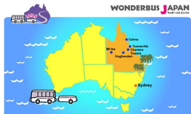
Tour route of WONDERBUS Japan 2006

To promote direct interaction with Australian children in outlying cities and towns where there are few opportunities for firsthand contact with Japanese culture, WONDERBUS Japan went on a two-week tour of Queensland in May 2006. Wherever they went, the volunteer crew engaged children in stimulating activities and workshops, including Japanese taiko drumming, Japanese dances, and origami . A total of 9,000 children took part over the course of the tour.