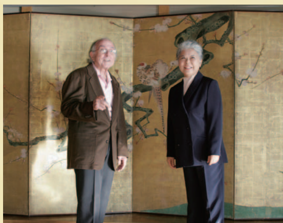
© Otsuka Toshiyuki/Omi Shigeharu Photo courtesy of Shogakukan Inc.