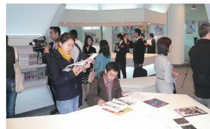
Opening of the “Face-to-Face Cultural Exchange Center” in Chengdu

Japanese life and aesthetics are currently featured under the theme of “Cool Japan.” We plan to open our second center in Changchun and Nanjing in the near future.