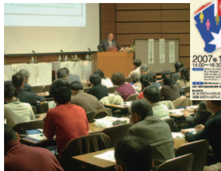
Symposium at Nagoya International Center

specialists, local leaders, and citizens to exchange opinions in a lively manner.