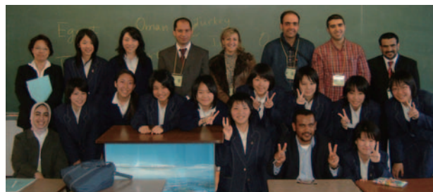
Visiting and interacting with junior high school students in the city of Hiroshima

As many people are battling against poverty and cannot