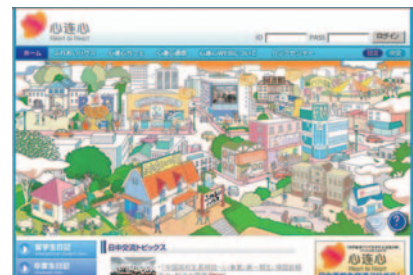
“Heart to Heart” community website