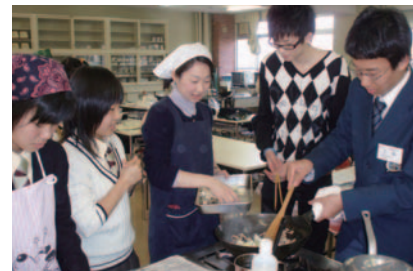
Interim seminar in Hiroshima; interacting with high school students from Aki Fuchu High School

students their own age. In 2007, the Foundation plans to extend invitations to 40 participants in each program.