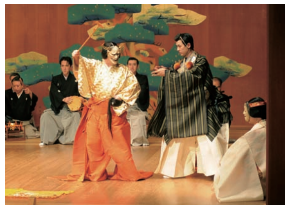
An Evening of Noh and Kyogen

The relocation of the office took place on February 23, 2009. At its new office located within the Kyoto International Community House building in Kyoto City's Sakyo-ku, the Kyoto Office has renewed its commitment to promoting international exchange activities through more active and stronger partnerships with local governments and a variety of cultural, arts and academic organizations.