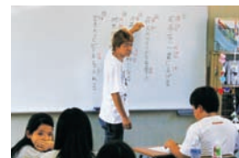
© Oizumi International Education and Skills Diffusion Center

In Oizumi, Gunma, the center actively supports local Brazilian children in learning the Japanese language, customs, and culture. It also organizes a cultural festival where local Japanese and Brazilian can understand each other about their own culture.