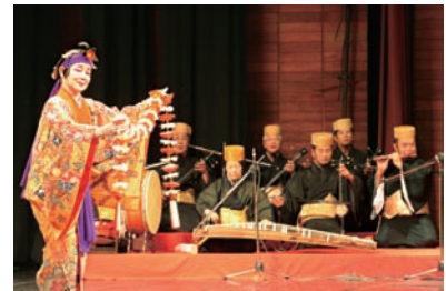
Okinawan dance performance

In the area of intellectual exchange, Japan Foundation, Manila prioritizes programs involving people in the conflict-affected region of Mindanao and promotes intercultural friendship between the people of Mindanao and Japan by