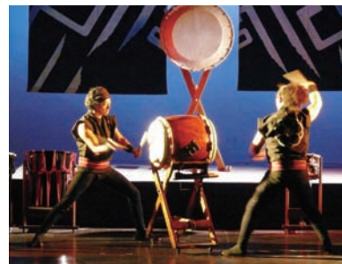
Nationwide tour by the Wadaiko Ensemble Abeya

Through JENESYS Program, young Japanese-language teachers were assigned to India, and Indian teachers and learners of Japanese, along with young creative professionals and next-generation leaders, were invited to Japan for training and study.