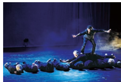
Performance by the Condors

In the area of Japanese-language education, apart from co-sponsoring a total of six speech contests both at national and regional levels, The Japan Foundation, Kuala Lumpur continues to make steady improvement to the infrastructure development of the