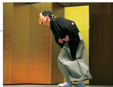
The origin, techniques, and expressions of Kyogen: a lecture and demonstration

In recent years, more Japanese cultural events have been held in cities outside Rome. The Institute supports this movement