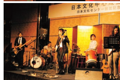
Above: HALCALI performing at the J-pop Concert in Beijing