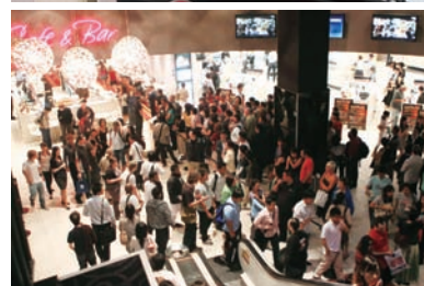
Crowds gathering at the Japanese Film Festival