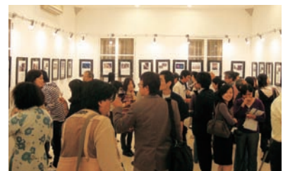
The Hanoi I Love, an exhibition by Japanese residents in Vietnam