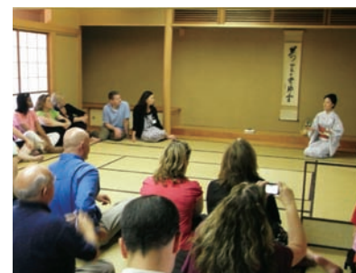
Cultural programs for the participants of the Japan Foundation Group-Tour Program for Educators (U.S. group)

In the area of arts and cultural promotion, the Japan Foundation, Los Angeles held NOH: Pathos Behind the Mask, consisting of a lecture and demonstration of Noh in five cities