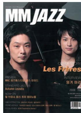
MMJAZZ, a Korean music magazine, featuring Les Frères on the cover

For the promotion of multilateral exchange, the Japan Foundation, Seoul supported the 2008 International Conference on Japanese-Language Education, which was held in Busan under the theme of wide-area network building. We also supported the Korea Japan China East Asia Literature Forum in 2008, attended by numerous authors and critics representing the three countries.