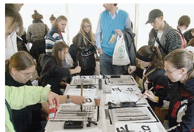
Calligraphy workshop at Animecon

It also hosted monthly cultural lectures and film screenings. At Animecon, an animation festival held in September for local animation fans, it participated by organizing a Japanese calligraphy workshop, a Japanese-language trial class, quizzes on Japan, and other fun programs designed to get young people interested in Japanese culture.