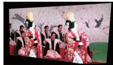
Kabuki theater brought to life on a high-definition big screen

To promote intellectual exchange, the Japan Foundation, Toronto joined with the University of Toronto and the Shibusawa Ei'ichi Memorial Foundation to host a symposium on the future direction of the Canadian-Japan relationship and the issues to be addressed following 80 years of diplomatic ties. A separate