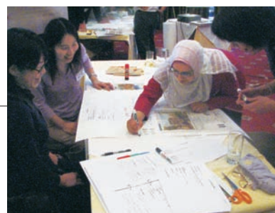
8th Middle East Seminar on Japanese-Language Education

As the office covering whole region of the Middle East, the Japan Foundation, Cairo has run several programs for the