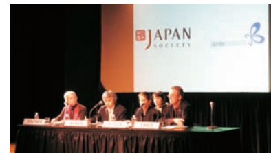
Japanese Art in America, a symposium held in March 2009 in New York

intellectual exchange, the Japan Foundation, New York served as the secretariat office for the American Advisory Committee for Japanese Studies. It also supported network building for researchers in Japanese studies through international conferences and symposiums, including the Annual Meetings of the Association for Asian Studies.