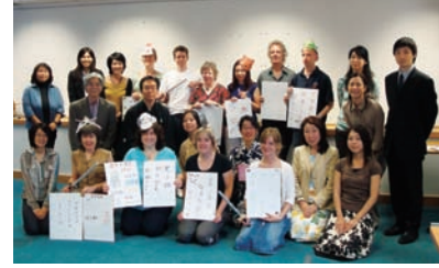
Refresher Course for non-native speaking teachers of Japanese-language

Japanese-language education programs included training courses for instructors on using original resources developed by the Japan Foundation, London as well as on the British examination system. Japanese-language teaching courses for non-native speakers of Japanese, the Talking Contemporary Japan course for general learners of the language, a speech contest, and a seminar on how to