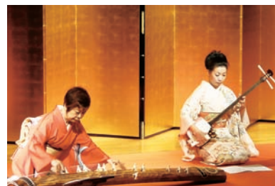
Traditional Japanese music performance featuring shakuhachi, koto and shamisen

Also, the Japan Foundation, Mexico, the only Japan Foundation center in Central America, supported various programs aimed at introducing Japanese culture to other countries in the region by supporting visits by prominent Japanese cultural figures resident in Mexico to neighboring countries.