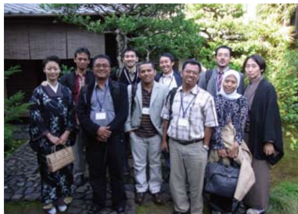
Above: At tea ceremony venue Left: Prayers at Hiroshima Peace Memorial Park