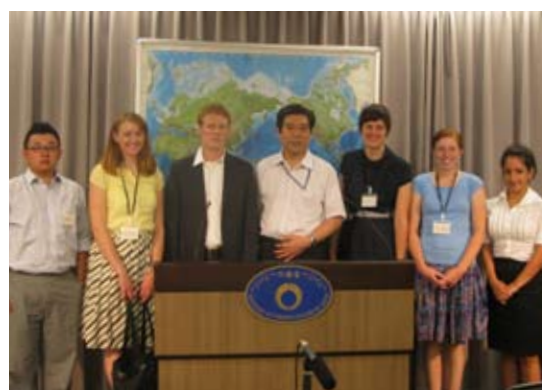
Above: Tour of NHK International Broadcasting Bureau Upper right: Orientation before departure (in New York City, U.S.A.) Lower right: Visit to Ministry of Foreign Affairs