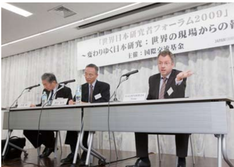
Public symposium at the Japan Foundation Headquarters

[Global Japanese Studies Scholars Forum 2009, Hakone-machi: Kanagawa Prefecture and Tokyo, October 13 to 15, 2009]