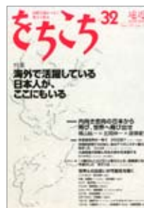
Left: Wochi Kochi magazine No. 32, the last edition in a paper-based format