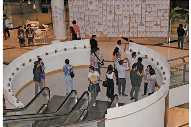
Media/Art Kitchen Exhibition in Bangkok.

other's language. It was a major hurdle for making music together.