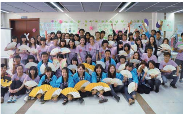
The first university student exchange event at Kunming Center for Face-to-Face Exchanges.

All the Centers for Face-to-Face Exchanges provide a chance to see Japanese culture and participate in cultural