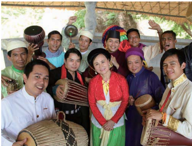
Performers from ASEAN countries.

It was not easy to screen and select the musicians for this project. They had to be specialists in traditional music, highly skilled at percussion instruments, and able to take part in the project for a long term. At the workshops, people even from neighboring countries still had different musical and cultural backgrounds and could not understand each