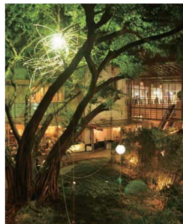
Tetsuya Umeda's Almost Forgot at Media/Art Kitchen Exhibition in Manila.

For such collaborative projects, we invite to Japan or send overseas, people in a supportive role in arts and cultural activities. They include museum curators and performing arts presenters and producers. Through our international symposiums and interactive events, these experts can network and reinforce mutual ties.