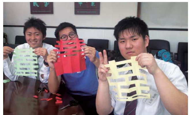
Making paper cutouts of "Double Happiness" Chinese characters with students at Shenzhen Foreign Languages School.

Thanks to this trip, the Japanese students had a true-to-life experience in China not possible in Japan. They now feel much closer to their counterparts in China.