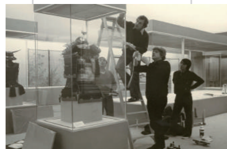
The Great Japan Exhibition: Art of the Edo Period in London in 1981.

2003 The Japan Foundation restarts as an independent administrative institution.