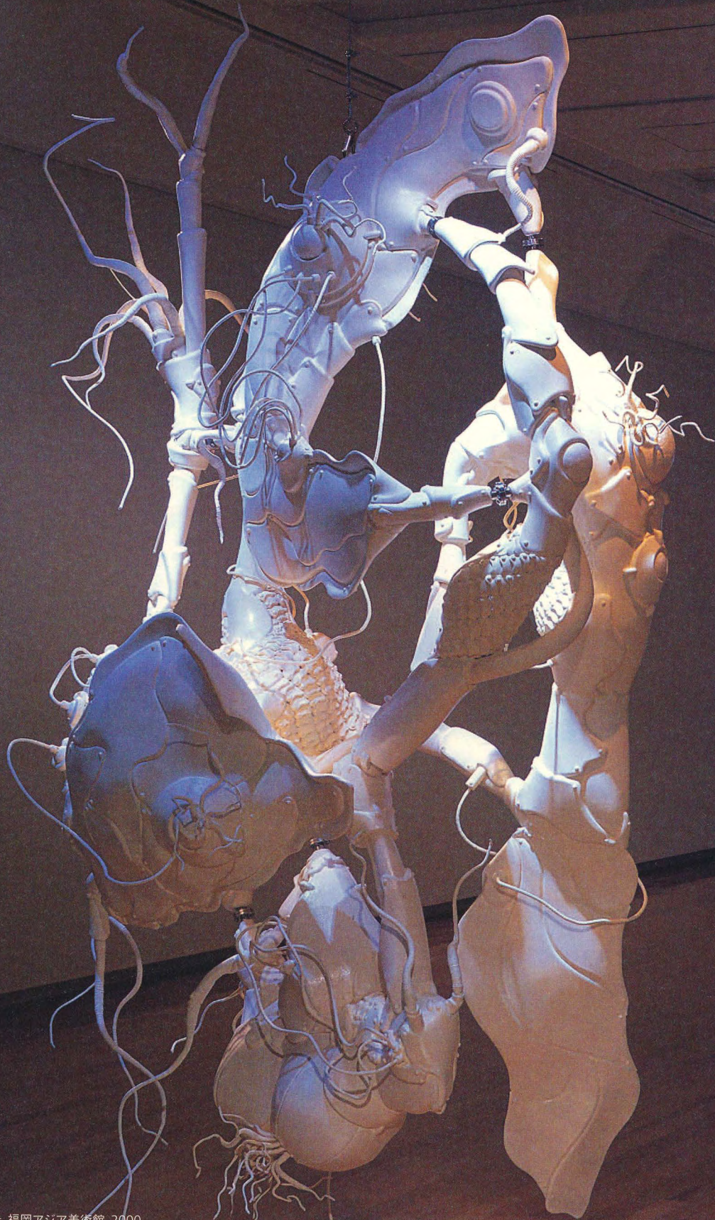
《さなぎ》(左)と《超新星》(右)の展示風景、福岡アジア美術館、2000 Installation view of Chrysalis (left) and Supernova (right) at Fukuoka Asian Art Museum, 2000