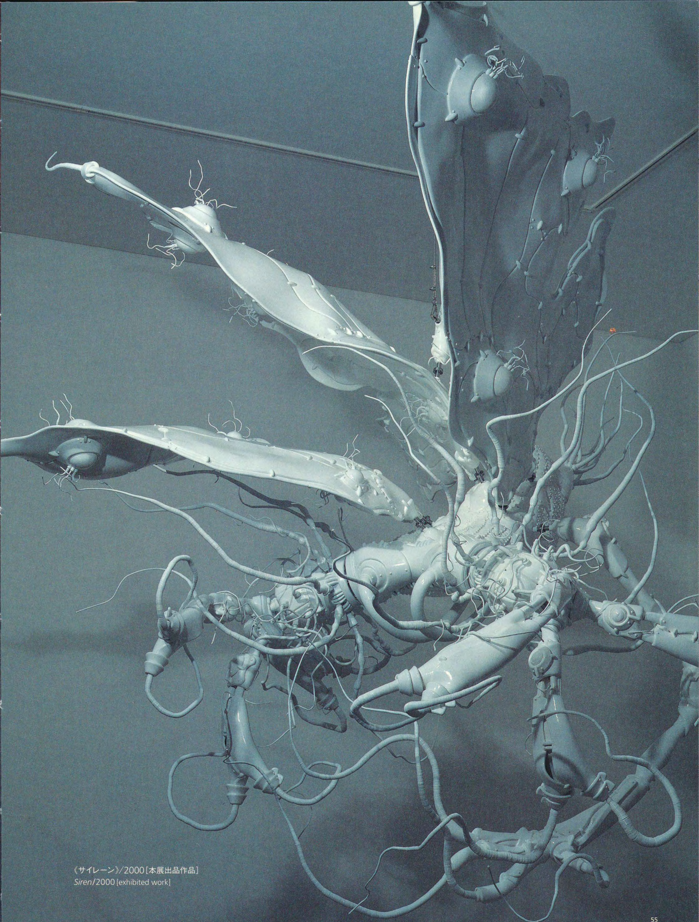
《サイレーン》/2000 [本展出品作品] Siren/2000 [exhibited work]