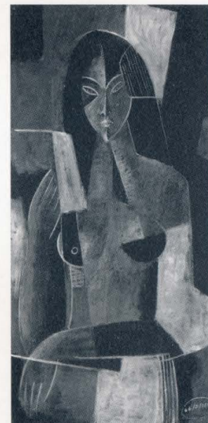
fig.3: Sompot Upa-In, A Lady , 1959, oil on canvas [color plate 13]