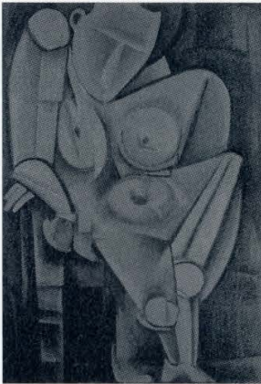
fig. 1: Yorozu Tetsugoro, Leaning Woman , 1917, oil on canvas [color plate 1]

Nevertheless, Asian painters did engage themselves in the painting of Cubist bodies and their paintings and the rhetoric accompanying them demonstrate various strategies for possessing the Cubist body. Yorozu Tetsugorô (1885-1927) was one of the first painters in Asia to submit the body to Cubist treatment. His Leaning Woman of 1917 (fig. 1) is a remarkable Cubist body image due its odd and compelling conflation of a robotic imagery of machinery with a rugged, earthy and primitive full-bloodedness that must have seemed an abrasive subversion and defamiliarization of decorous body imagery in Yorozu's milieu in Taishô Japan. Both of these qualities of Yorozu's figure — the robotic appearance of its rubbery limbs and the sense of fecundity that gives it the impression of a mother goddess — may be associated with Cubist imagery of the body. In an often repeated statement of 1914, however, it was the primitive and not the mechanical that Yorozu embraced as his own preferred embodied: "A barbarian has begun to walk within me," he declared, while demoting Cubism and Futurism to the status of "superficial . . . products of civilization." 9 This suggests that in Yorozu's case, the possession of the Cubist body entailed a personal re-negotiation of the duality of barbaric/civilized, a negotiation that had rich precedents in European Cubism and also was a theme of broader currency in Yorozu's social milieu in Japan. 10