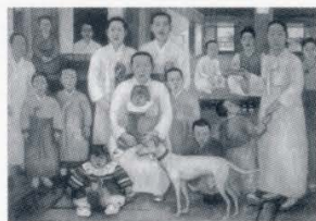
fig.2: Pai Un-sung, Family , 1930-35, oil on canvas

now perceived as an expression of “motherly love” (e.g. Chae Yong-sin, fig.1).