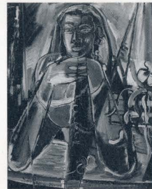
fig.2: Cheong Soo Pieng, Malay Woman , 1950, oil on board [color plate 14]