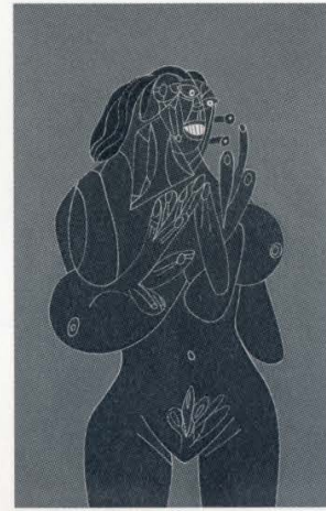
fig.1: E.N. Souza, Lady in Black , 1962, tempera on paper [color plate 12]

The word “uncanny,” which I have used here, is actually a technical term expressing a concept proposed by Freud. It is a significant word that is sometimes brought up in discussions of female representation. Without going into excessive detail, I would like to point out that Freud used this word to describe situations that arouse “castration anxiety.” 1 This concept leads us to the problem of fetishism, another concept that is useful in thinking about the representation of women in art. 2 As generally understood by most people today, fetishism is a form of abnormal attraction for a certain type of object, but Freud’s original idea was somewhat different from this. To Freud, fetishism is an act carried out by a (male) subject in order to find a substitute for the phallus in response to an object (without a phallus) that arouses castration anxiety. Thus, the object of fetishism is a “phallic substitute.” A subject (practicing fetishism) suppresses castration anxiety by obtaining a “phallic substitute,” which gives him a superficial sense of security. Also, the substitute fetish object