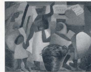
fig.4: Nena Saguil, Tindera , 1952, oil on plywood