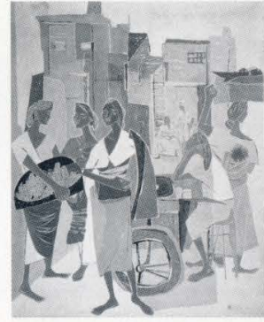
fig.3: Park Re- hyun, Open Stalls , 1956, colored ink on Korean paper [color plate 10]

To conclude, this analysis on the Asian Cubist paintings of this exhibition illustrates the various different ways in which Cubism developed in Asia. In particular, the fact that the mother and child or the female labourer are subjects which appear frequently in Asian Cubism can be understood as an expression of Asian modernity. Some paintings contain elements (such as the use of rich, sensual color) which make it difficult to determine whether or not they can actually be defined as Cubist paintings, an issue which the organisers of this exhibition would also have struggled with. And in a way, this may be what makes this exhibition on Asian Cubism such an interesting one, as it is an excellent example of the way in which a specific style, once transported from the area of its original conception to a different environment, can develop in new and different directions.