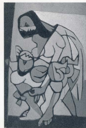
fig.3: K.G. Subramanyan, Mother and Child , 1953, oil on board