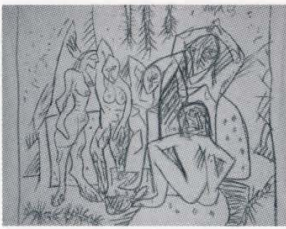
fig.4: E.N.Souza, Frolic , 1963, oil on canvas [color plate 5]

E.N. Souza (1924-2002), however, practiced Cubist body techniques without any apparent need to distance himself from Cubism. Over half a century after Picasso completed Les Femmes d'Alger , Souza painted a rough parodic reprisal of Picasso’s composition in oil-on-canvas grisaille (fig. 4). The five figures of prostitutes who were so scandalous in Picasso’s rendition that Braque said they made him feel as if “forced to drink kerosene or eat rope,” 17 were now endowed with an even higher degree of revulsion. Souza gave Picasso’s brazen temptresses masks of a still more alienating and misogynistic character, deformed their bodies with markings suggesting disease, and gave one figure, the woman on the left, the legs and cleft feet of an animal.