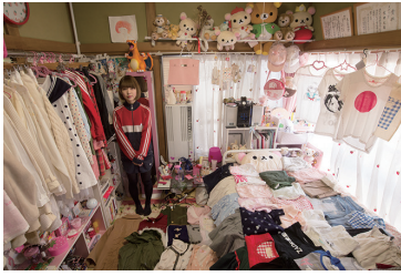
Kyoichi Tsuzuki HAPPY VICTIMS - keisuke kanda