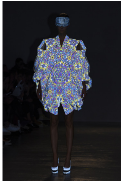
ANREALAGE 2016 S/S COLLECTION «REFLECT» © 2015 ANREALAGE