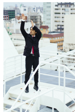
ASICS x keisuke kanda x ANREALAGE Jersey meets suits