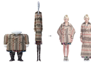
ANREALAGE 2010 AW COLLECTION « WIDESHORTSLIMLONG »