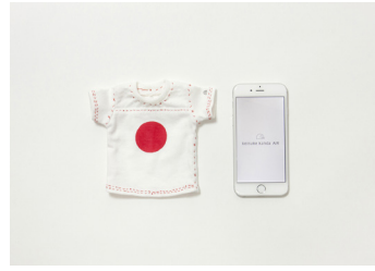
keisuke kanda keisukekanda_AIR