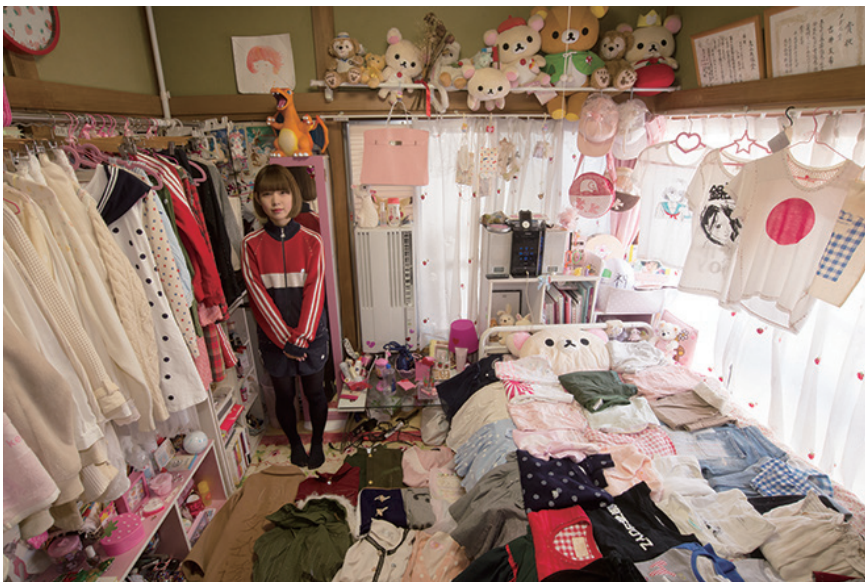
Kyoichi Tsuzuki HAPPY VICTIMS - keisuke kanda