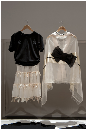
Installation view Keisuke Kanda + ANREALAGE, ANOFUKU, 2017